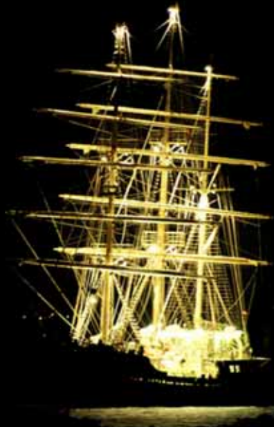
Photo: The 'Tennessee' in Banpo Bay, by Ross, http://creativecommons.org/licenses/by-sa/2.0/