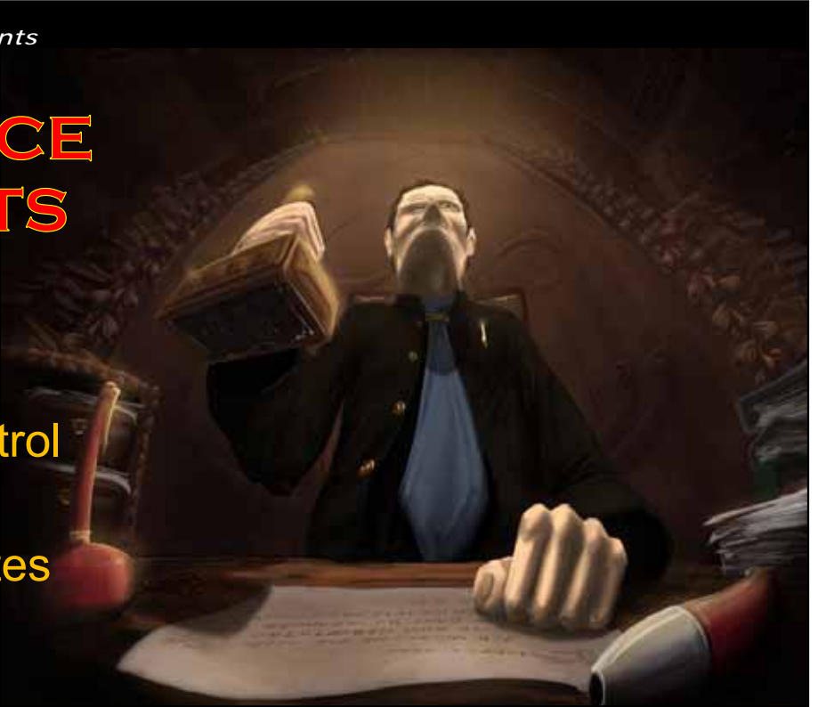
Image: Soviet bureaucracy, all over the web, no copyright listing.

Export control and compliance is huge subject..... But at the risk of being overly simplistic, there are just three main types of compliance documents. These are..