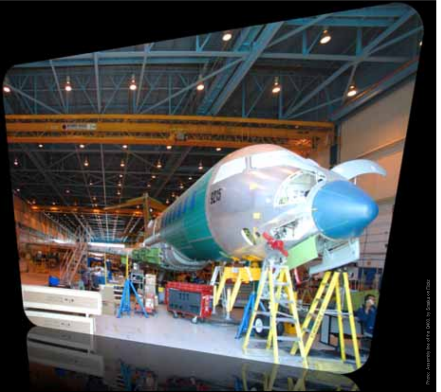
Photo: Assembly line of the Q400

Through your market research, you found that some of your target markets have various entry requirements that will cause you to incur additional expenses in order to “qualify” your product for market entry. These might include: