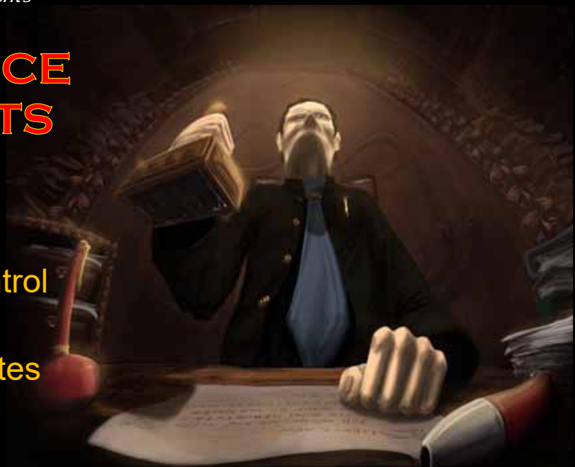
Image: Soviet bureaucracy, all over the web, no copyright listing.